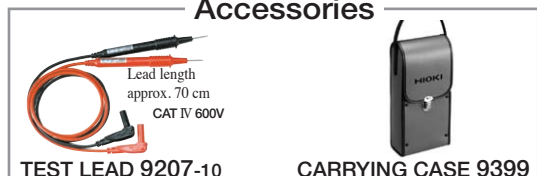
TEST LEAD 9207-10